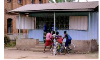
The first Breadshop in Ifakara

It has been a very eventful and busy year for our charity in Ifakara and we felt it was about time that we should give you an update. The Bakery: The news from the bakery is very good as they produce at least 400 loaves a day and sometimes have to increase it to anything up to 900 loaves. They had to engage more 'bakers' and we are pleased that local people could fulfil this task. We receive the bakery's annual accounts which are enlightening as we can see that they continue to use their profits wisely. These accounts also serve the useful purpose to confirm that the money we send is spent for "The Free Bread Funds".