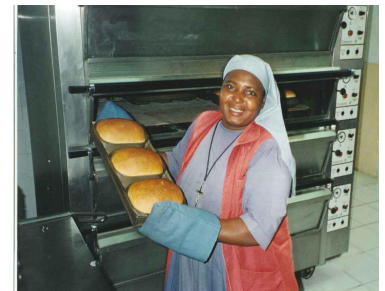
The Ifakara Bakery

We established the bakery 10 years ago in September 2001 and never had to intervene financially. They produce up to 900 loaves a day. It is run as a successful business. Whenever there are problems in growing the local staple food of Maize the bakery makes sure that no one dies from starvation. Those who can pay for the bread do so but others, irrespective of tribal or religious affiliations are not forgotten.