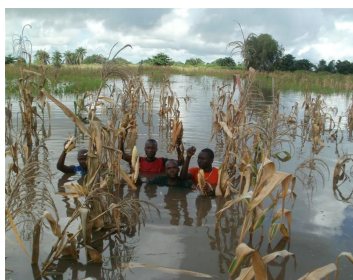
Rescue of Maize Crop