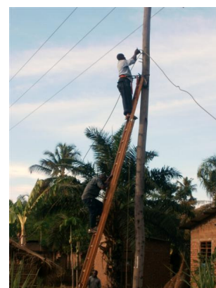
Electricity Reaches Lihami

Last year we made the first attempt in providing electricity to a small settlement on the outskirts of Ifakara. This has been very successful as the people have built a study house and their children receive further education in most subjects taught in secondary schools by qualified people. Now they have proper lighting so they can do their homework even when it is dark. A room has been equipped with computers and a small library has been established.