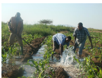
Irrigating Maize Field