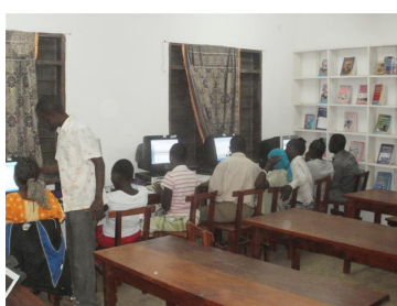
Computer Room and Library in Valenova Building

The benefits from the supply of electricity and improved harvest results through irrigation are huge and of great importance to these people in raising their standard of living and health.