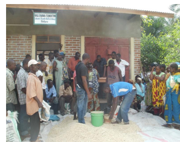
Maize Distribution by Valenova

We created this fund for those who have so little. It was of great help when many Ifakara farmers lost their crops due to flooding on Good Friday. They managed to rescue only a little and we agreed to fund 80 bags of Maize to avoid starvation. It was distributed by the Valenova Foundation, a local NGO, which we helped to set up earlier.